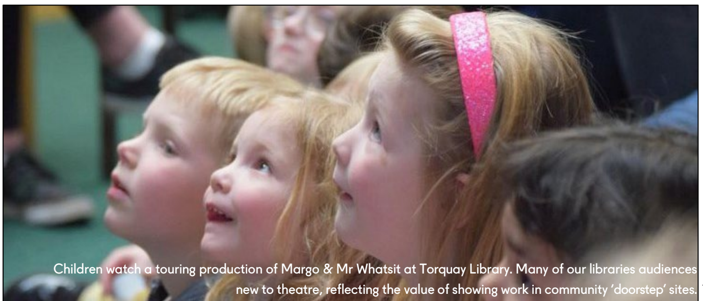
Children watch a touring production of Margo & Mr Whatsit at Torquay Library. Many of our libraries audiences new to theatre, reflecting the value of showing work in community 'doorstep' sites.

From 2020-2022, we will continue to work with Torbay venue and producing partners to provide a consistent platform for outstanding touring theatre in Torbay, growing the regional infrastructure to be hungry and ready for receiving such work. We will deepen SW regional partnerships, including experiments to efficiently cross-programme with key SW regional partners. On a larger scale, we will scope toward an ambitious reflective model for sharing best practice in co-creating and touring theatre for children in collaboration with CYP specialist companies and venues.